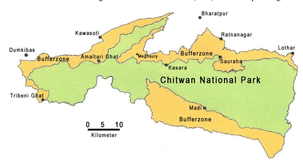
Figure 1: Chitwan National Park, Nepal

The wildlife has been an integral part of the park because it has attracted many tourists from all over the world but the animals like rhinos are in the state of danger in Chitwan National Park (CNP) because of poaching and habitat loss.